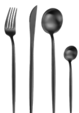
POMPEI 44 DB9911