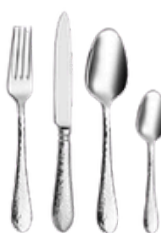
MARTIN 38 DB9038