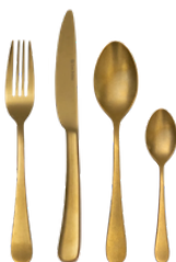
ELEANOR (D) 28 DB9022-D-AMBER