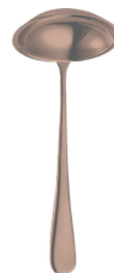
Soup Ladle DB9022SOL-D-BRASS Length: 300mm 3.0mm | 18/10 12/120