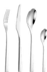
VENICE 12 DB9013