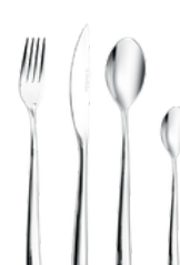
MEROPE 36 DB9036