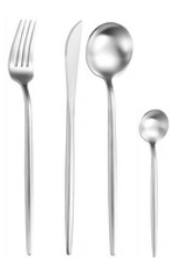
POMPEI 43 DB9111