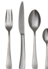
ELEANOR (D) 26 DB9022-D-SILVER