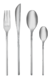
LORENZO 10 DB9006