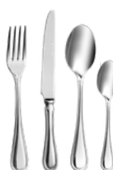
ATLAS 32 DB9031