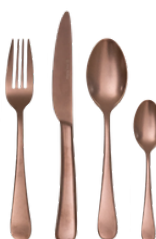
ELEANOR (D) 30 DB9022-D-BRASS