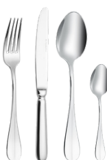
BAGUETTE 20 DB9020