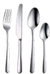
LEONARDO 8 DB9004