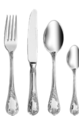
VINTAGE 42 DB9219