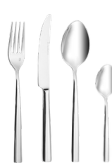
ROSA 22 DB9021