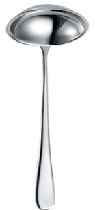
Soup Ladle DB9022SOL Length: 300mm 3.0mm | 18/10 12/120