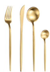
POMPEI 43 DB9411