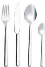
SOPHIE 40 DB9039