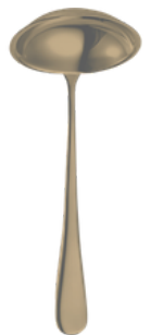
Soup Ladle DB9022SOL-D-AMBER Length: 300mm 3.0mm | 18/10 12/120