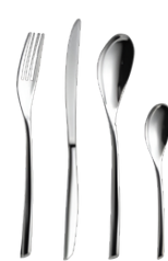
CARMINE 14 DB9014