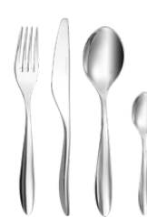
LUCA 16 DB9016