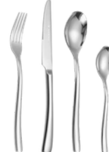
GIOVANNI 46 DB9001