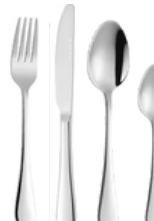
VALENTINO 48 DB9010