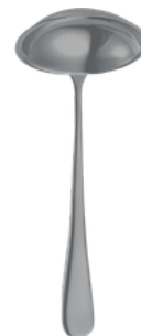
Soup Ladle DB9022SOL-D-SILVER Length: 300mm 3.0mm | 18/10 12/120