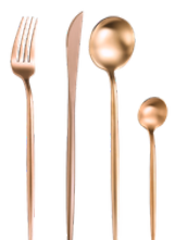
POMPEI 44 DB9711